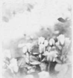
Roses blooming out in natural daylight after being started in a Bruli Pantry Garden.

is a special concept that may seem impractical, but this horticultural breakthrough is revolutionizing dinner plates all over the country already! No more sending the children to the back yard for basil just to find that it has been eaten by rodents. No more rain washing away the new harvest before full bloom. No more waiting for seasons to change to determine your crop. How does it work? A simple bulb that emits a pre-measured amount of light is installed in any cupboard to shine on your indoor garden just like the sun. Presets exist for all types of different indoor gardens. For a small extra fee, add the